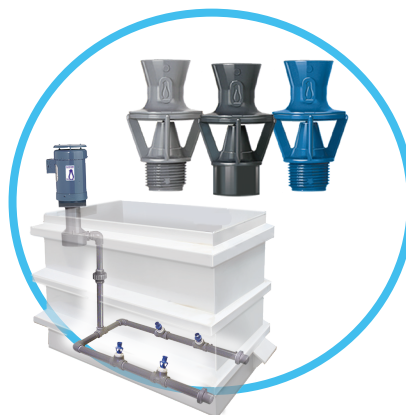
Eductors Space-saving eductors for the process/finishing industry