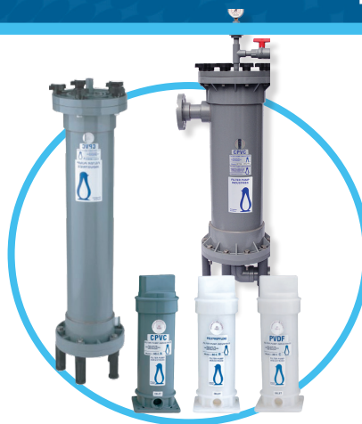
Chambers Cartridge, bag, and carbon chambers