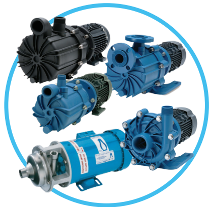
Centrifugal Pumps Horizontal pumps