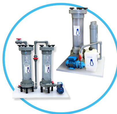
Recovery Systems Precious metal recovery systems