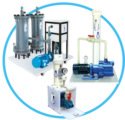
Filter Systems Corrosion-free filter systems