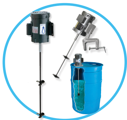
Mixers Mixers for tanks and drums